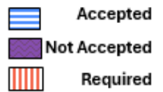
Diagram of ORU^R01^ORU_R01 Message Segment Structure with New Mexico Reporting Requirements